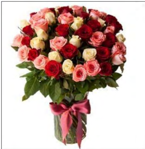
Mix Roses Bouquet $146++ for 45 filler Code: 1113