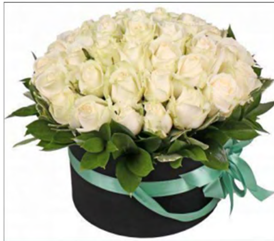
Box of White Roses $101++ for 20 filler Code: 1138