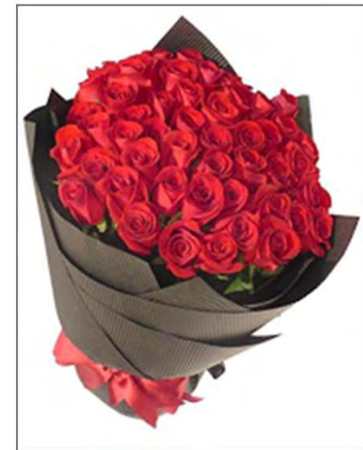
Red Roses Bouquet $159++ for 50 filler Code: 1000